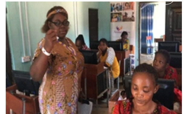
"Apprentices with their lecturers"