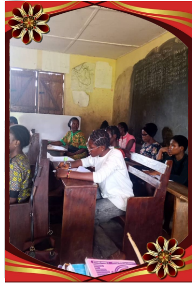
Apprentices with their lecturers at the Saturday lectures