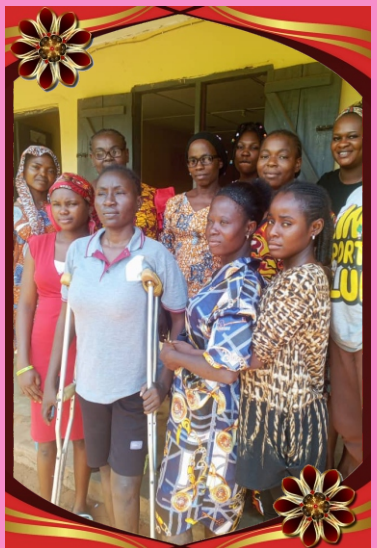
Apprentices at their Placements